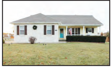
3002 Clarendon Rd. $215,000 #82435 3 Bedroom / 3 Bath / Basement