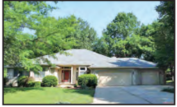
2015 Twin Pines Dr. $289,900 #80877 3 Bedroom / 3.5 Bath / Basement