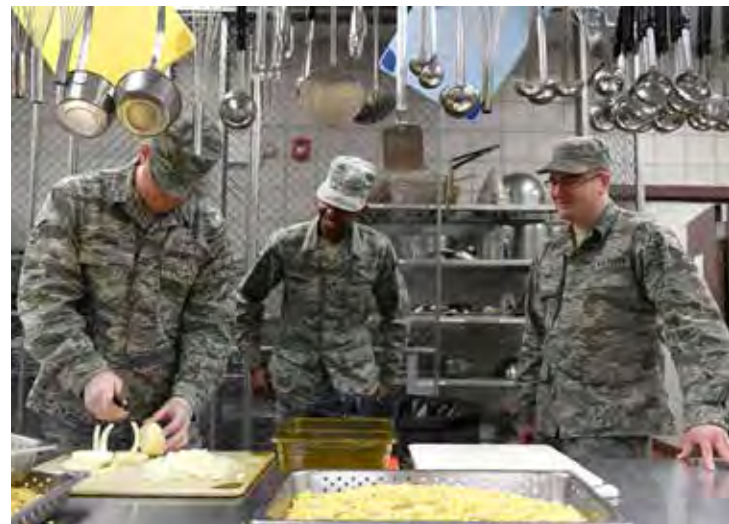
• Members from the North Carolina Air National Guard and Niagara Falls Air Reserve Station, New York, prepare lunch in the dining facility during drill weekend at the North Carolina Air National Guard Base, Charlotte Douglas International Airport, Jan. 12, 2019. Food services Airmen from the North Carolina Air National Guard trained members from the Niagara Falls Air Reserve Station on full-service kitchen operations.