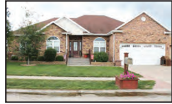
19700 Mockingbird Ln. $300,000 #81881 5 Bedroom / 3.5 Bath / Basement