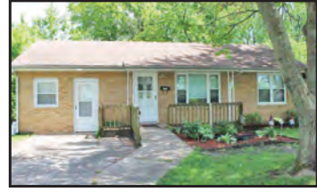
1311 Arlington Ave. $79,900 #82087 3 Bedroom / 1 Bath