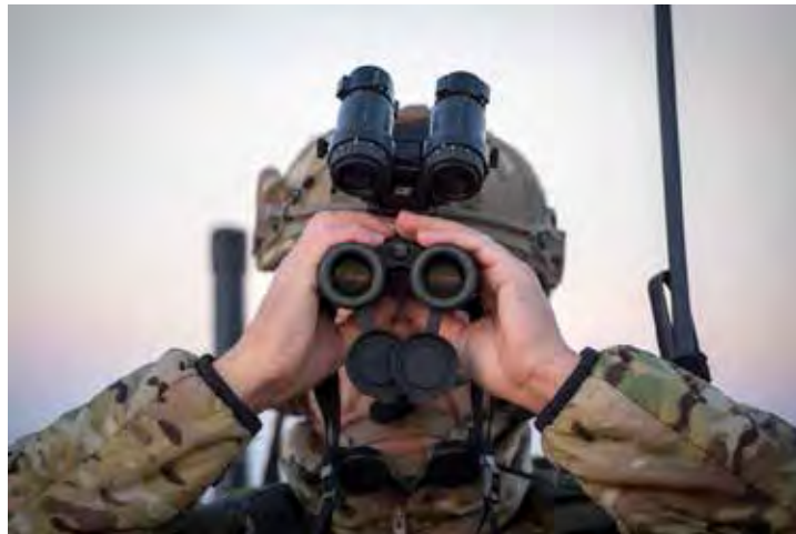
• A Royal Danish Air Force Landing Zone Safety Officer monitors an inbound Danish C-130J Super Hercules preparing to land at Field Six on Eglin Air Force Base, Fla., Jan. 15, 2019, during Exercise Emerald Warrior 19. Emerald Warrior 19 provides annual realistic and relevant pre-deployment training. It encompasses multiple joint operating areas to prepare special operations forces, conventional force enablers, partner nations and interagency elements to integrate with and execute full-spectrum special operations. All aspects of live, virtual and constructive training assets are used.