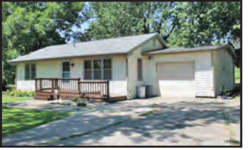
2016 S. Ingram Ave. $79,900 #81259 2 Bedroom / 1 Bath