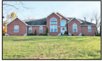
29330 Apple Valley Rd. $384,900 #82152 4 Bed / 3 Bath / Bsmt / 1.40 Ac